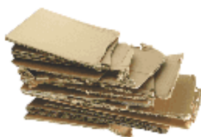
Corrugated Cardboard (Wavy center layer)