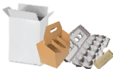
Boxboard (Dry-food boxes, egg cartons, & rolls)