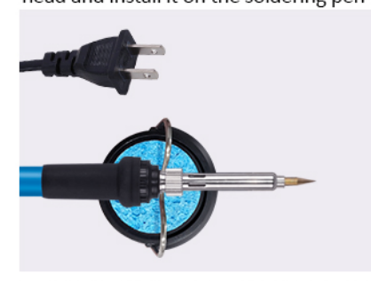
5.Turn off the power after completion 6. Complete your work and wait for it to cool down