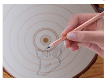
1. Draw your favorite pattern on the board