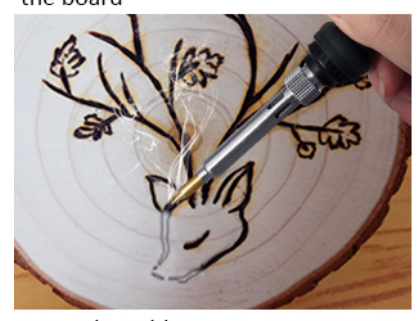
4.Use the soldering iron to paint on the board.